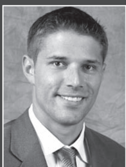
STILL HUNTER, III